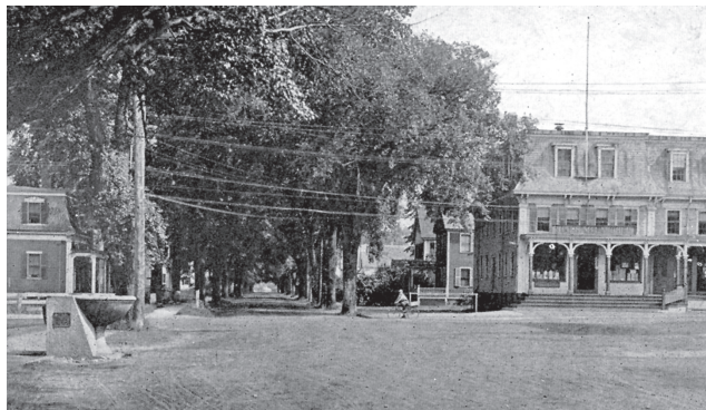
Ashland Centre photographed looking south on Main Street toward Union Street, 1915.

Your interest in Ashland's fascinating history is much appreciated.