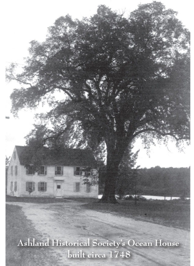
Ashland Historical Society's Ocean House built circa 1748

Co-sponsored by the Ashland Historic Commission and the Ashland Open Space Committee, with assistance from the Ashland Historical Society